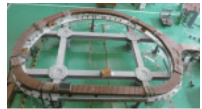
Fig.3-3 Insulated one - third - scale double pancake (5.1 m × 3.8 m)

A DP is composed of a RP and a conductor, which is inserted in the grooves of the RP. The winding is composed of seven DPs and is inserted in a coil case, and together, the winding and the case comprise the TF coil.