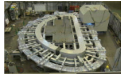
Fig.3-4 Full-scale radial plate (13 m × 8 m) The mock-up is composed of ten segments, which are welded by the machine.