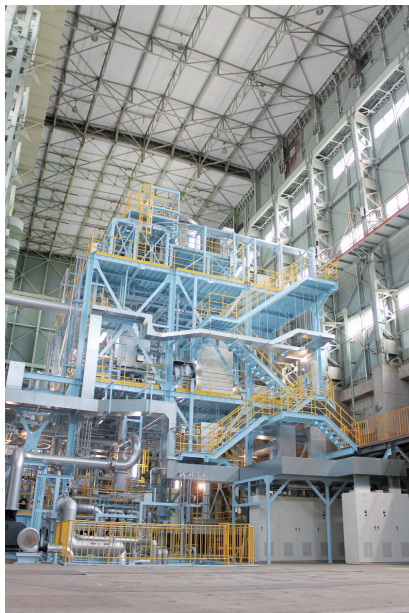
Fig.12-16 The IFMIF/EVEDA lithium test loop (ELTL) The dimensions of the facility are 15 \times 15 \times 25 m. 2500 kg of lithium is loaded in the ELTL.