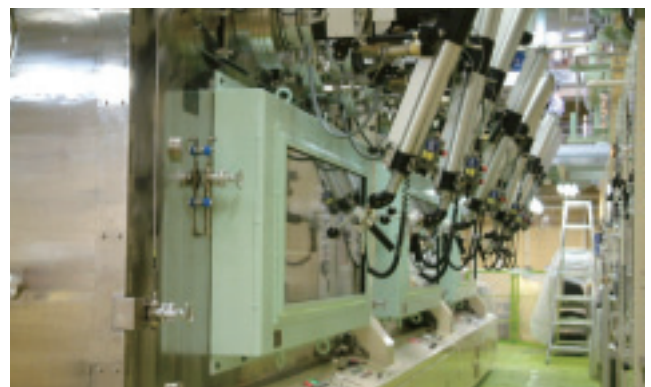
Fig.8-3 Module for TRU High-Temperature Chemistry (TRU-HITEC) installed at NUCEF

To measure nuclear data for various nuclides such as minor actinides, the Accurate Neutron-Nucleus Reaction measurement Instrument (ANNRI) is under operation.