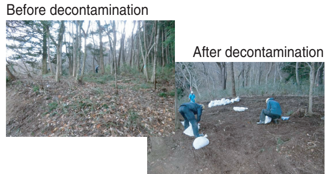
Fig. 1-14 Before and after photos of the test location In the broadleaved tree area, grass mowing, raking of fallen leaves, and removal of the litter layer were applied as decontamination methods.