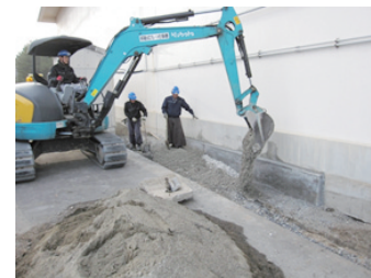
Fig.13-8 Recycling of the concrete debris

We crushed concrete debris to satisfy the quality requirements of RC40 after the regulatory authorization of clearance.