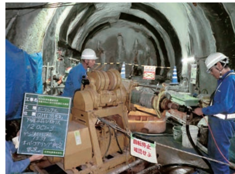
Fig.3-8 Rock stress measurement GL.-300 m gallery.

Hydraulic fracturing tests in a borehole drilled from the surface and overcoring tests in boreholes drilled from a gallery were used to determine the in situ rock stresses. In 2009, the Japanese Geotechnical Society standardized the techniques used in compact conical-ended borehole overcoring (CCBO). However, the CCBO technique does not work if groundwater is present because water reduces the effective adhesion of the strain cell to the rock. Furthermore, the occurrence of dinking at the conical-ended overcore does not allow