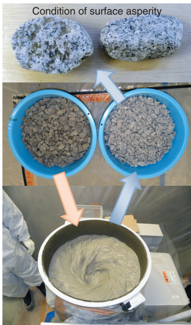
Fig.1-8 Decontamination test by milling method We tested gravel decontamination using a general-purpose barrel finishing machine with 20 kg of gravel, 20 ℓ of water, 150 rounds per min, and 20–60 min of grinding time per batch.