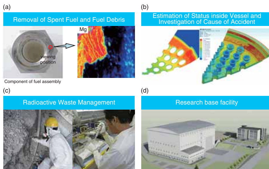
Fig.1-2 Overview of JAEA's Activities toward the Decommissioning of the TEPCO's Fukushima Daiichi NPS

(a) A detailed inspection of samples taken from the unirradiated fuel assembly at 1F4, (b) an example of simulation results for failure of the lower head of the reactor pressure vessel, (c) JAEA staff picking rubble around 1F4 for analysis, and (d) an image of the Remote-controlled Equipment and Device Development Facility.