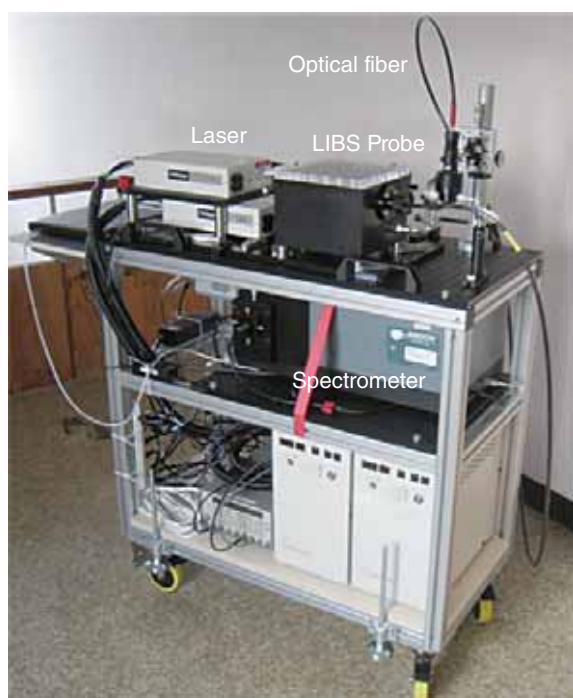
Fig.1-25 Prototype of the transportable LIBS apparatus

This instrument, whose size is 1.2 m (W) × 1.5 m (D) × 0.5 m (H), is composed of lasers, optical fibers, a LIBS probe, and a spectrometer.