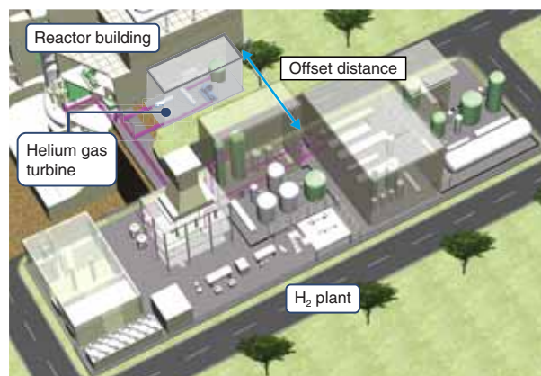
Fig.6-3 Candidate heat application system layout coupled to the HTTR

The nuclear heat transferred to the secondary helium (He) system at the intermediate heat exchanger (IHX) is used by the He gas turbine system and the H 2 plant for power generation and hydrogen production.