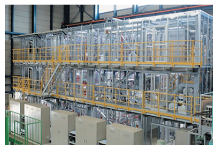
width 18.5 m × depth 5 m × height 8.1 m

We adapted SiC ceramics to fabricate a sulfuric acid decomposer and evaluated the corrosion resistance of the SiC