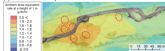
(c) Unmanned helicopter + new Compton camera