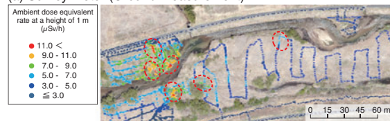
(b) Unmanned helicopter + ordinal detector