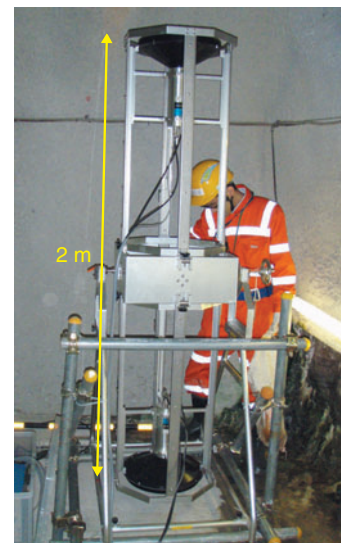
Fig.8-14 Photograph of the experimental-muon telescope

The telescope is equipped with two plastic scintillators 35 cm in diameter and 3 cm thick to detect simultaneous transmission of muons.